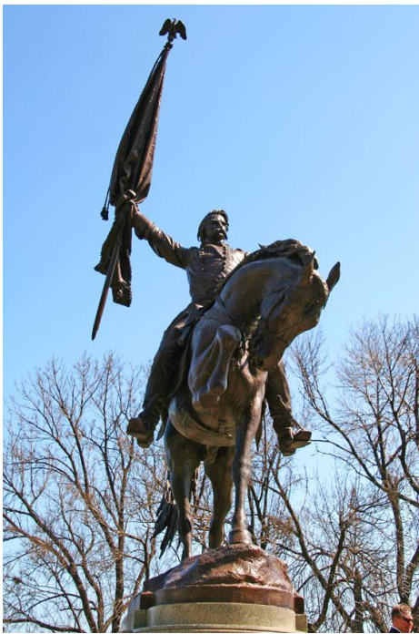
Statue of Gen. John A. Logan at Grant Park in Chicago

Originally called Decoration Day, from the early tradition of decorating graves with flowers, wreaths and flags, Memorial Day is a day for remembrance of those who have died in service to our country.