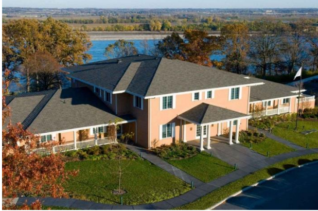
What the Fisher House at Lake Nona will look like upon completion.

Fisher House Foundation ensures that there is never a lodging fee. Since inception, the program has saved military and veterans' families an estimated $360 million in out of pocket costs for lodging and transportation.